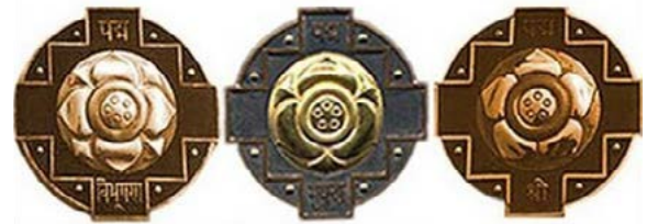
Padma Vibhushan Padma Bhushan Padma Shri

Padma Vibhushan: The second-highest civilian award in India; for exceptional and distinguished service.